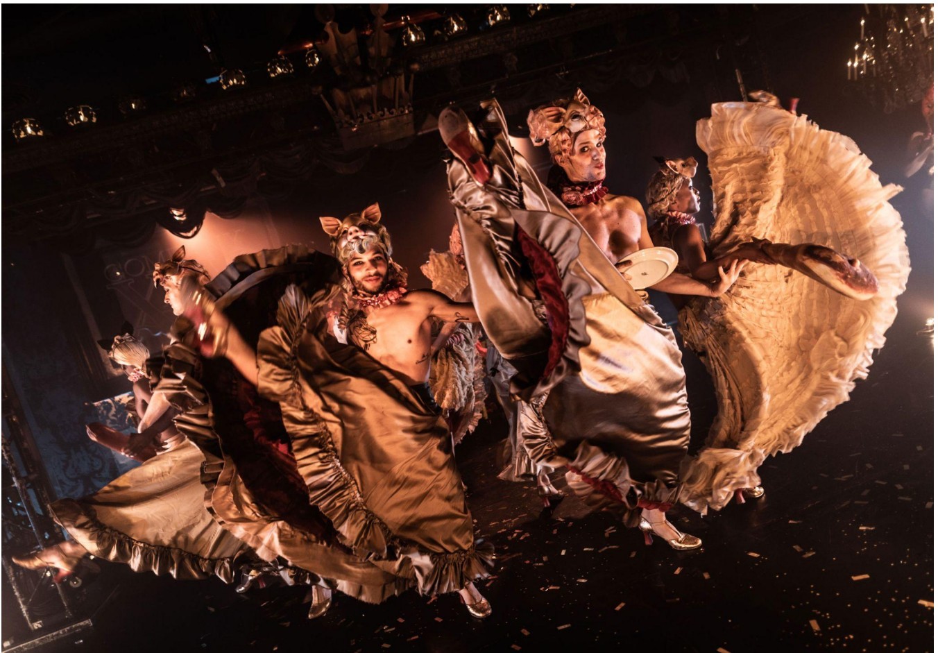
Gluttony climaxes in a naughty and exuberant cancan featuring the beauties of Company XIV