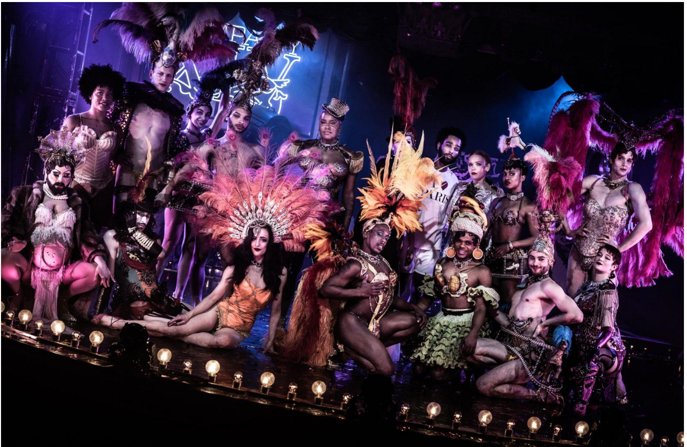
The cast of Seven Sins by Company XIV.

Members of the press are cordially invited to Seven Sins , a Baroque Burlesque refashioning of the story of Adam, Eve and the fall of man. Immerse your senses in an elegant, hedonistic dreamscape of athletic circus, sensual dance, virtuosic singers and lush design. Members of the press are invited to attend Seven Sins with weekly shows Thursday through Sunday at 8pm. Please email press@companyxiv.com to claim your seats.